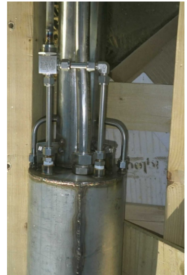
The sensor housing eliminates thermal drift of the sensors and prevents vertical movement.

The LRDP has a precision of 0.0002 inches when making a single level measurement, and enough sensitivity to measure volume changes as small as 0.03 gallons per hour in a 100-foot-diameter tank. This high degree of precision is obtained because the differential-pressure sensor does not have to operate over the