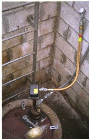
The uppermost portion of the reference tube, capped by the valve actuator

The key component of the LRDP is the vertical “reference” tube, which spans the full usable height of the tank (see diagram). The fuel in the tank is allowed to enter or leave the reference tube through a valve located at the bottom of the tube. When the tank is to be tested, the valve is closed, isolating the fuel in the tube from the fuel in the rest of the tank.